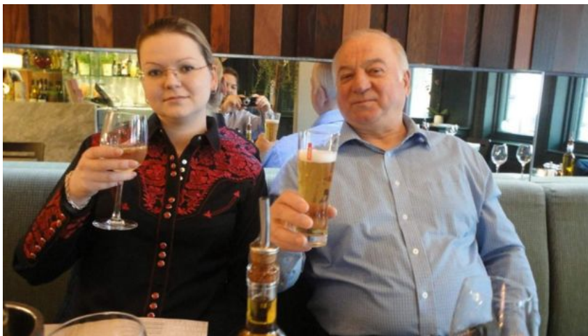
Sergei Skripal and his