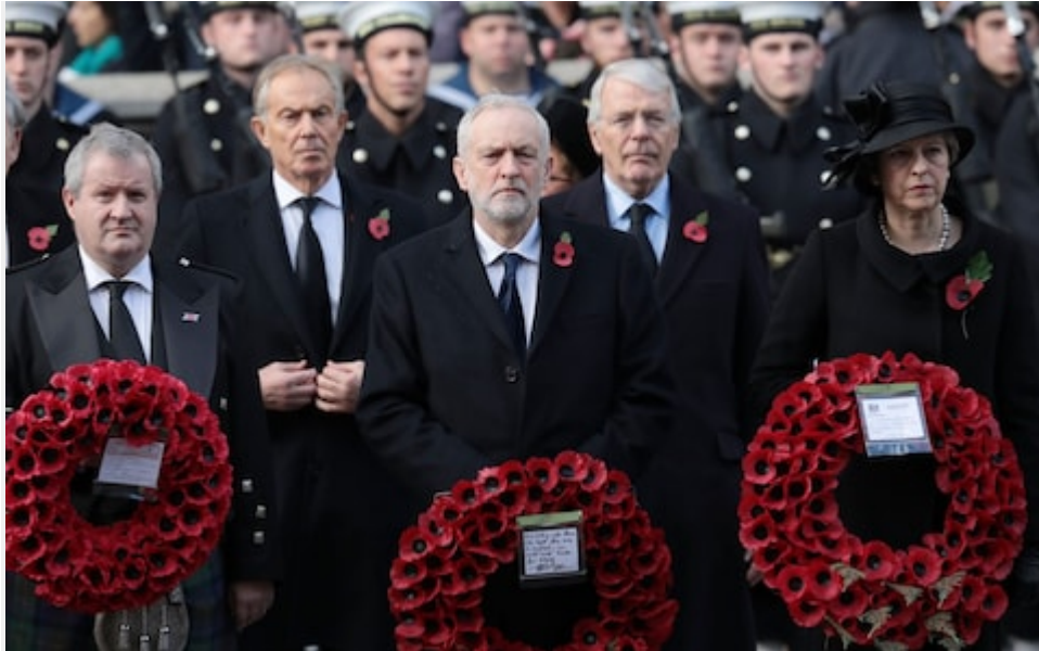
Politicians lay their wreaths

The firing of a gun marked the end of the silence, and The Last Post was sounded by the Buglers of the Royal Marines before the wreaths were laid.