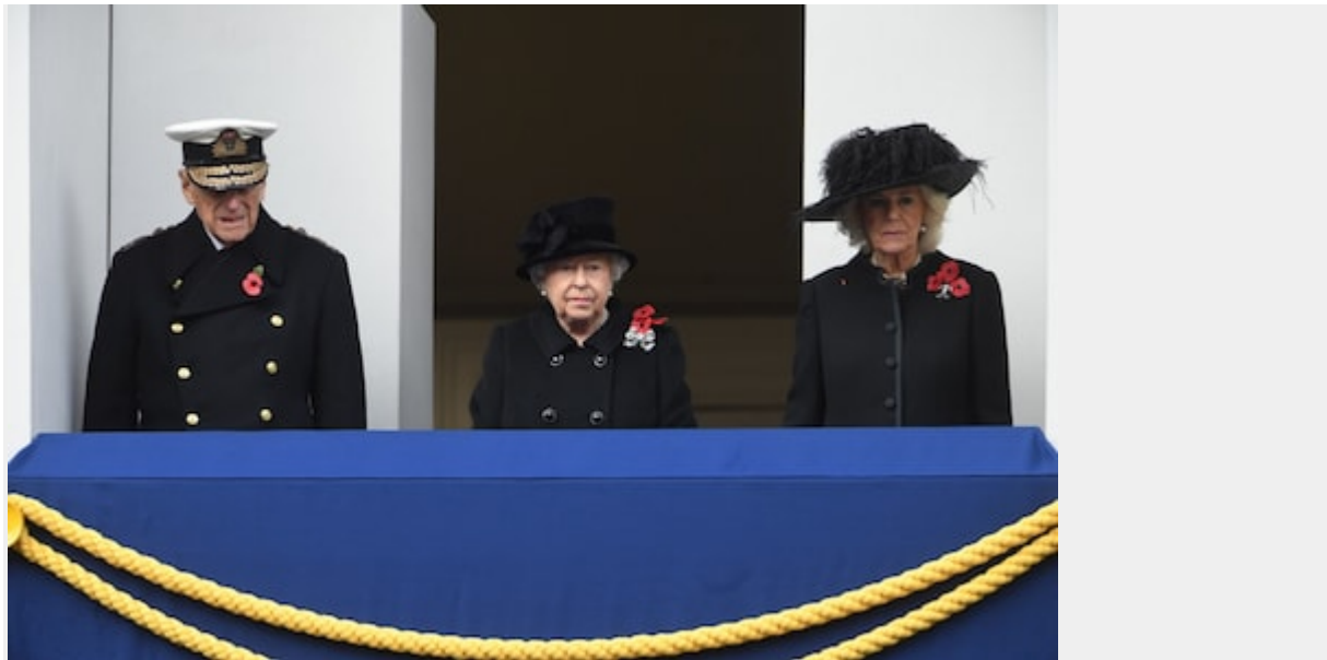
The Duke of Edinburgh, Queen and Duchess of Cornwall watch the Cenotaph ceremony

A two-minute silence took place at 11am and wreaths were laid at the foot of the Whitehall memorial by senior royals and political leaders including Prime Minister Theresa May and Labour leader Jeremy Corbyn.