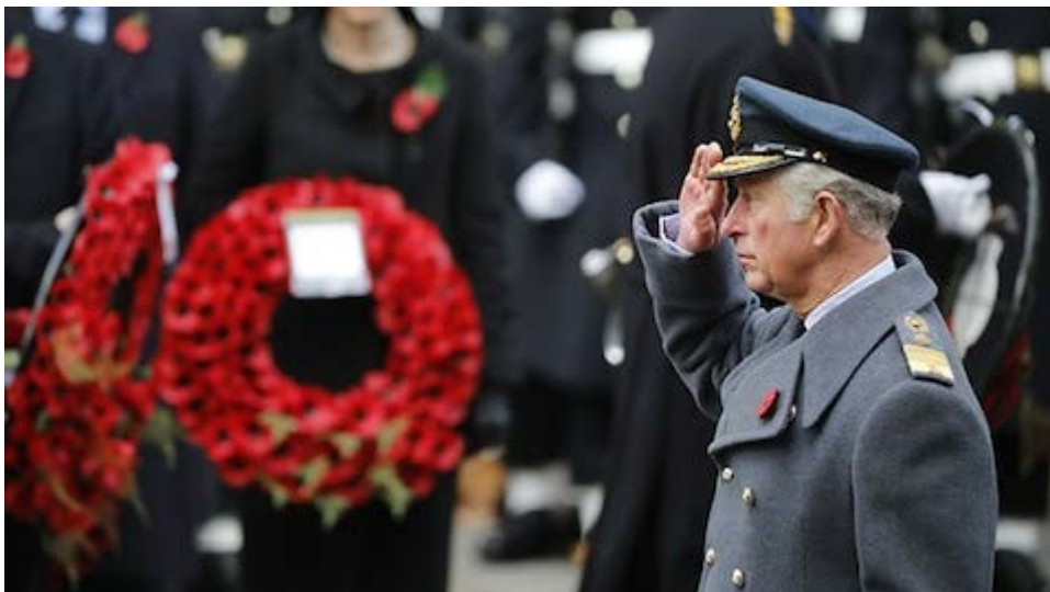
Prince Charles leads

Remembrance Sunday: Queen watches Whitehall service from balcony for first time as Prince Charles lays her wreath