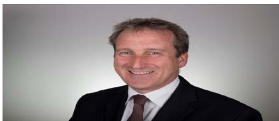
Education Secretary Damian Hinds