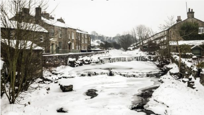
Freezing temperatures were felt in the Yorkshire Dales National Park