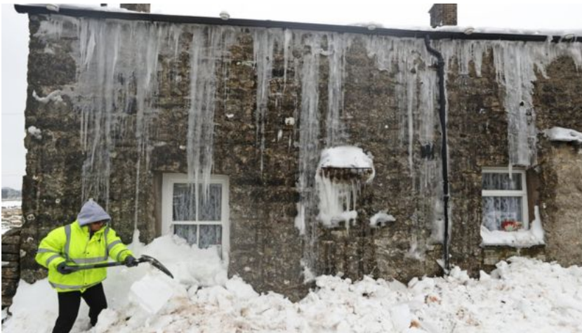
Many people had been snowed in for days, including Mags Turnbull from Browfoot Cottage in Cumbria

The UK's economic growth is also likely to take a short-term hit, experts have warned, predicting a "disaster" for the high street as people staying at home turned to online shopping.