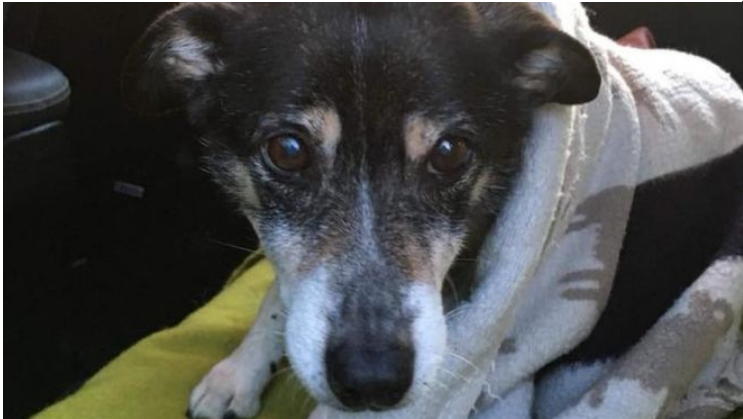
Red was found on Saturday after surviving nine wintry nights in the mountains

It is a remarkable tale of the kindness of strangers and a hardy pet surviving against the odds.